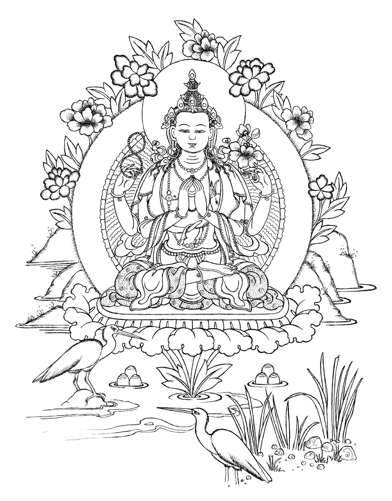
Buddha of Compassion